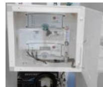
Sensor set for O2, CO and CO2